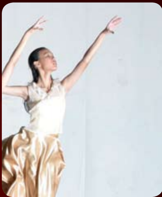
School Achievements 2008 荣誉榜